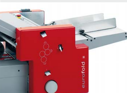
Friction feeder. For all A3-models.

In response to the needs of today, Eurofold offers the customised solution, and for the uses of tomorrow the ability to upgrade with other modules and new developments. The computer supported models offer extremely high user friendliness and can be adjusted to a new fold by the single touch of a button. Manual movements are almost eliminated. Recurring jobs can easily be stored in the memory.