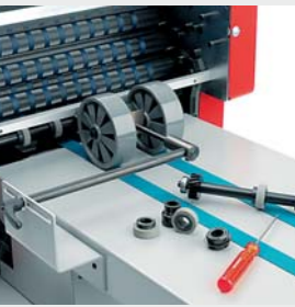
Scoring and perforating.

Multigraf AG Graphic Arts Machines Grindelstrasse 26 CH-5630 Muri Tel. +41 56 675 58 00 Fax +41 56 675 58 60 mail@multigraf.ch www.multigraf.ch