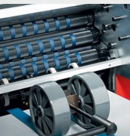
Steel-rubber rollers with diagonally toothed gears.