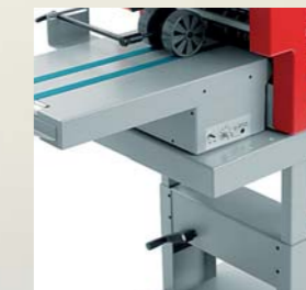
The height adjustable stand. For a versatile use of the Eurofold folding machines.