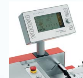
Preselect and spacer unit. Includes all necessary elements for counting, spacing and controlling.