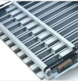
Detail of the automatic folding plate.