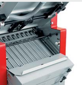
Accessibility to the lower folding plate.