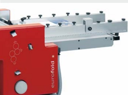
Suction feeder. High accuracy for the professional use.