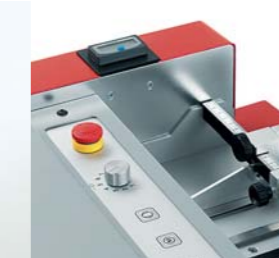
Total counter. The most effective possibility to control your job.