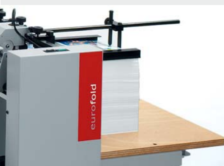
Deep pile feeder. To improve the productivity.